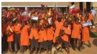
Every child receives a chicken dinner and present

Joy abounds on this special day happening this month, December 22 th . Our apologies for forgetting to remind sponsors that funds should be gotten into the Christmas fund by November. It was to our great surprise that even without a reminder, we received funds totaling just $1000 short of our usual amount. Praise God for his care of this ministry. His wing covers us and the people we love in Uganda in bountiful ways. Thank you for your prayers! So many have given all through the year, but if there are those who haven't, and would still like to donate (as long as it arrives before the 12 th .) we are able to wire it to Uganda ahead of the party. Please consider adding a bit more this month and marking Christmas fund for this wonderful celebration.